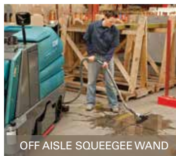
OFF AISLE SQUEEGEE WAND

Off-aisle squeegee wand increases flexibility and access into hard-to-reach spaces.